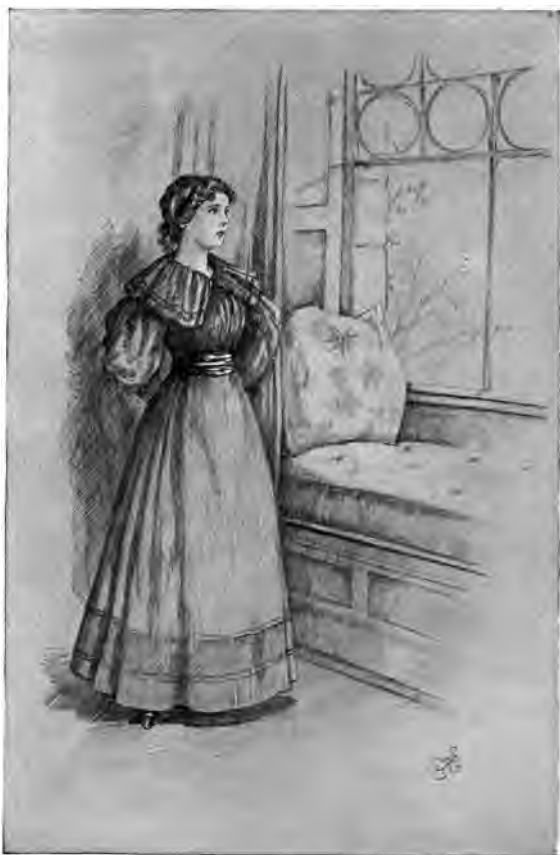
"POLLY . . . STOOD AT THE FARTHER LIBRARY WINDOW